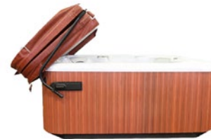
COVER MATE EX - COVER LIFTER