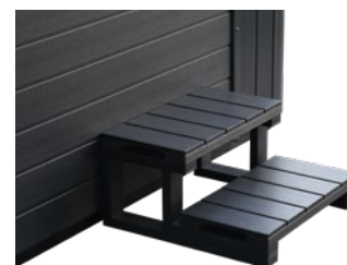
2 TIER STEPS