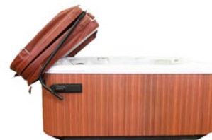
COVER MATE EX - COVER LIFTER